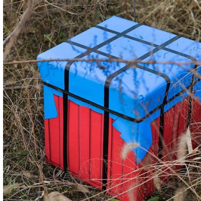
Airdrop in the game(?)

PUBG is a multiplayer online battle royale video game. In the game, up to one hundred players parachute onto an island and scavenge for weapons and equipment to kill others while avoiding getting killed themselves. Airdrop in this game is a key element, as airdrops often carry with them strong weapons or numerous supplies, helping players to survive.